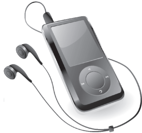
A personal stereo