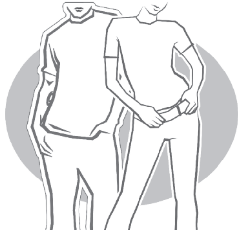
Clothes in the latest style