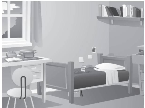
Your own bedroom