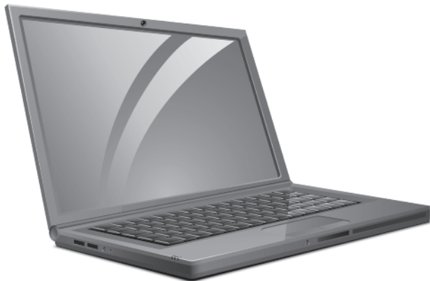
A personal computer