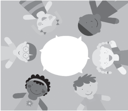
Opportunities to share opinions