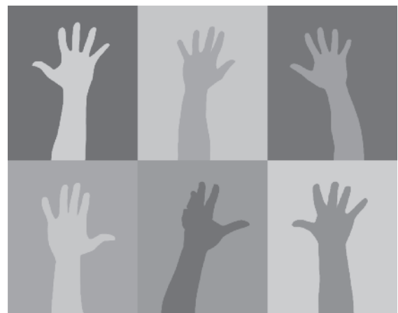
Opportunities to practise your own culture, language and religion