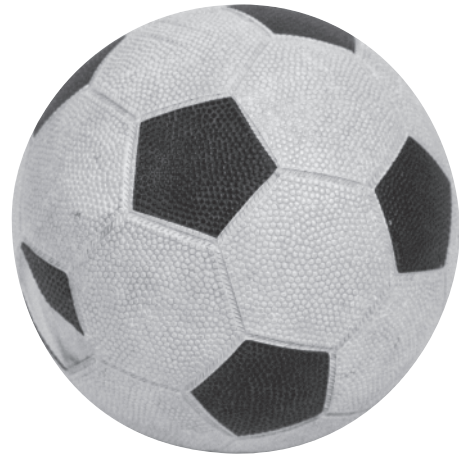
Playgrounds and recreation